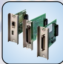
Plug-In Interface Modules