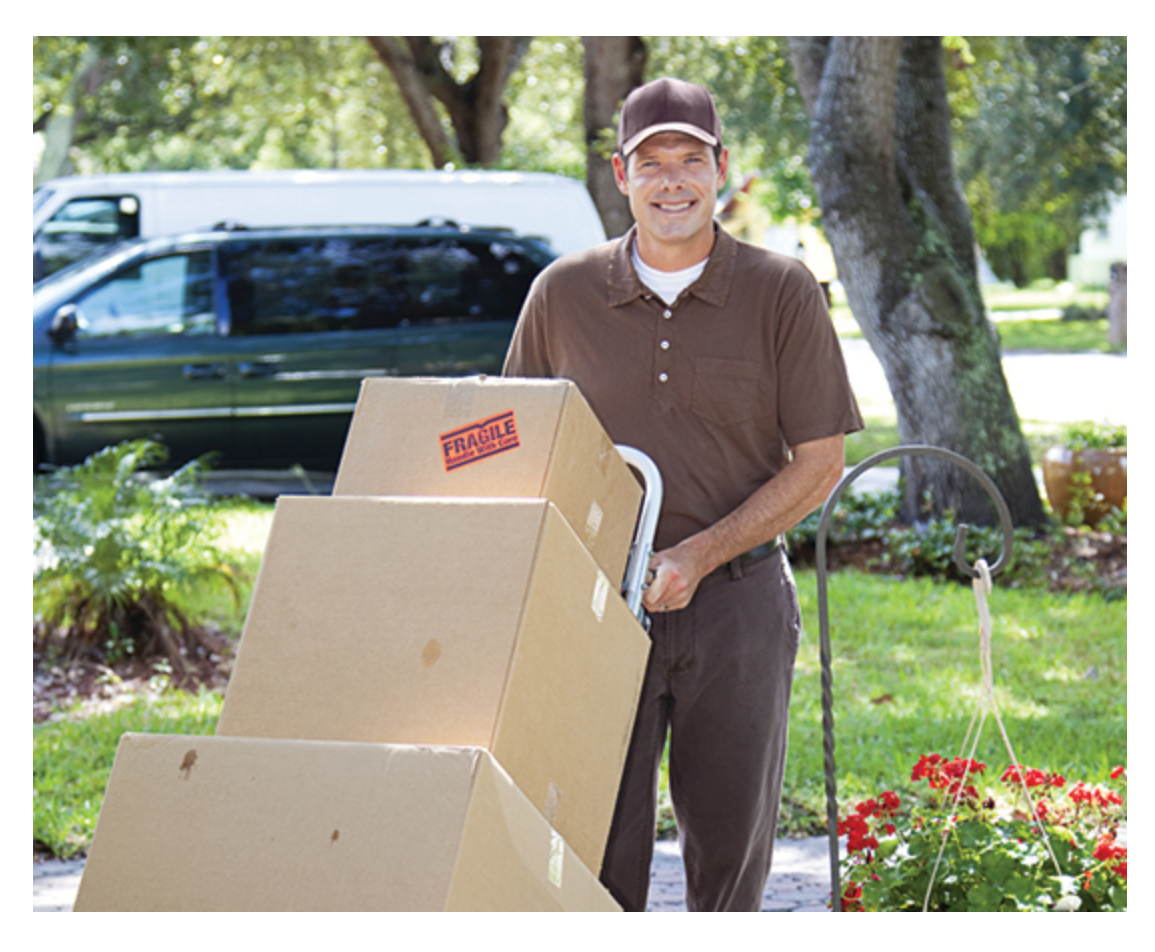
Transportation & Logistics