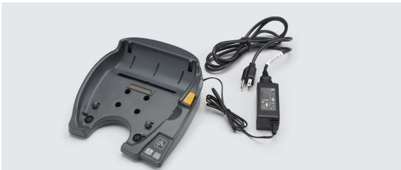
QLn420 Charging and Ethernet Cradle